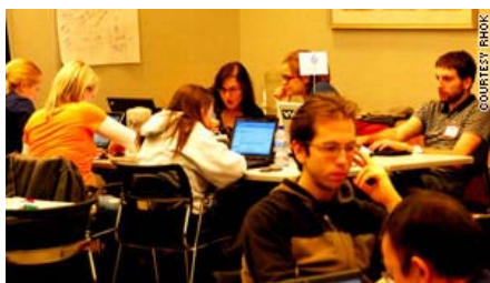
Hackers at a Random Hacks of Kindness gathering in December 2010 in Chicago.

Sabet is also quick to point out that "hacking" doesn't always mean what some people might think.